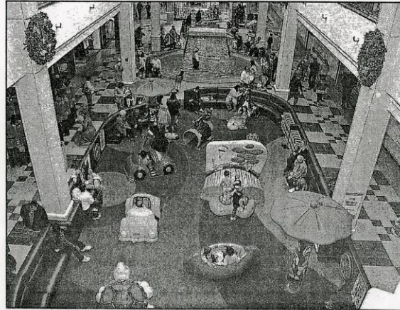
Westfield Sunrise and Koi pond